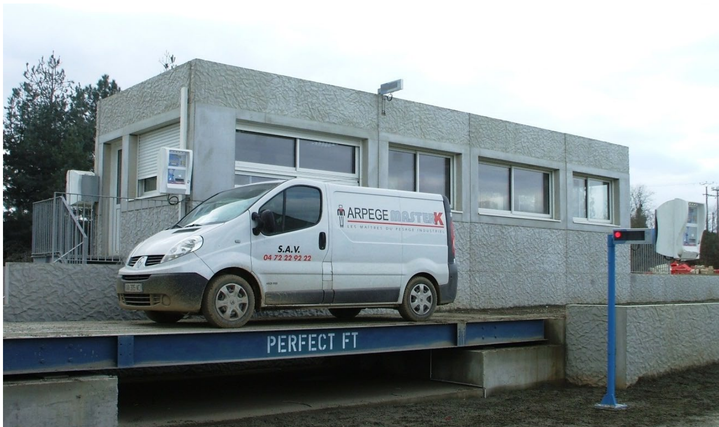
INTEGRATED ACCESS CONTROL ON WEIGHBRIDGE