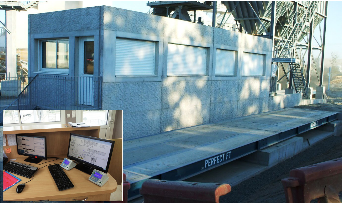
SITE ENTRANCE WEIGHBRIDGE AND PROCESS CONTROL ROOM