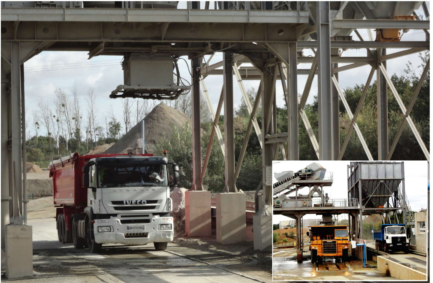
WEIGHBRIDGE WITH CUSTOMISED DIMENSIONS