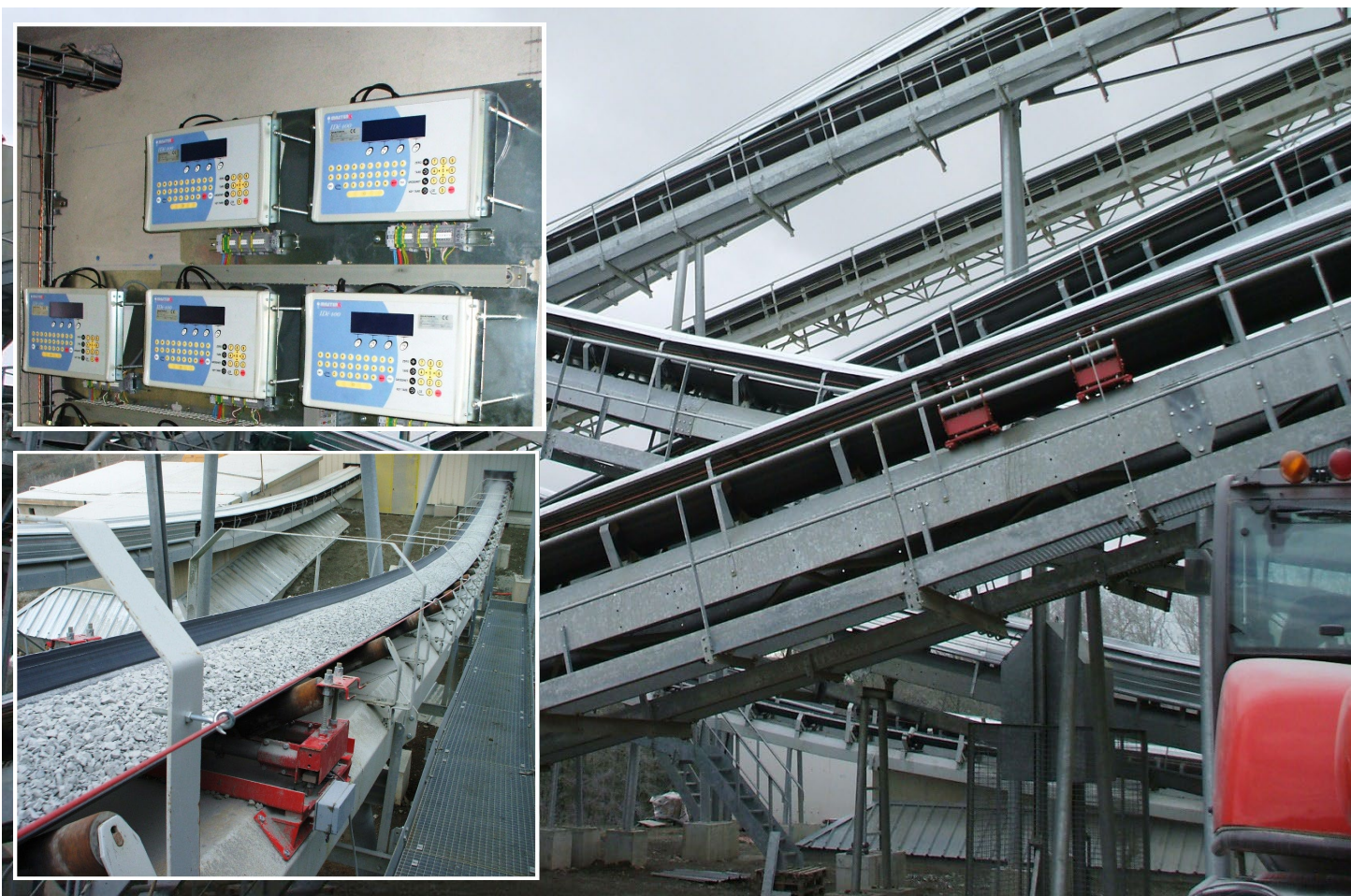
MULTI SCALE MANAGEMENT ON BELT CONVEYOR