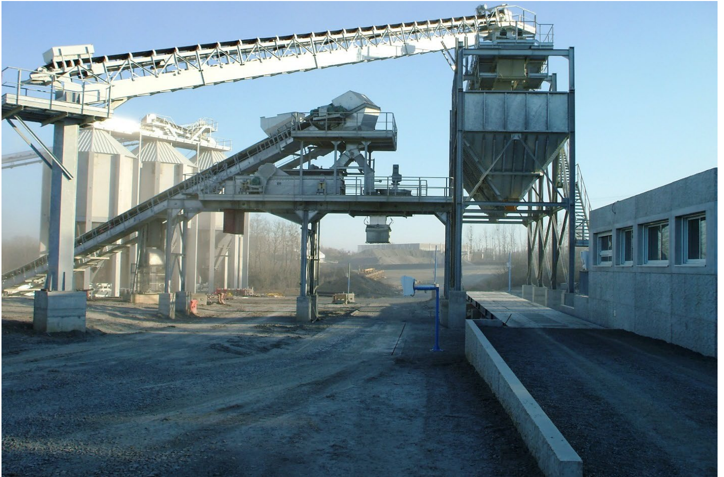
ACCESS CONTROL AND LOADING CONTROL ON WEIGHBRIDGE UNDER HOOPER